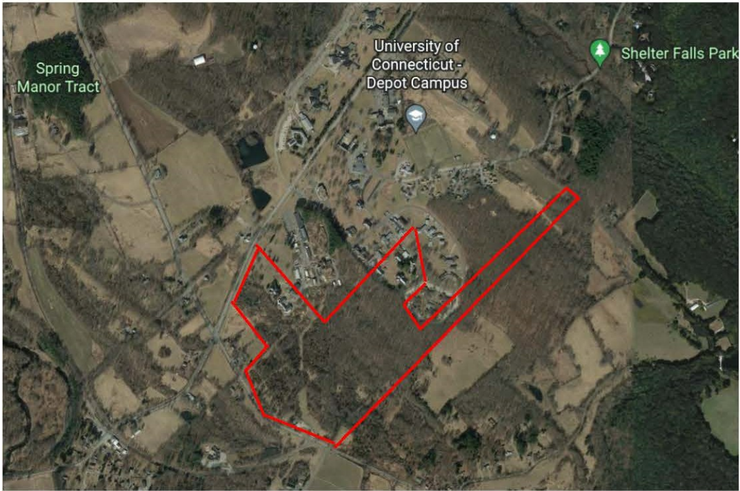
Proposed Land Area on Depot Campus for the Connected and Automated Vehicle (CAV) Test Tract