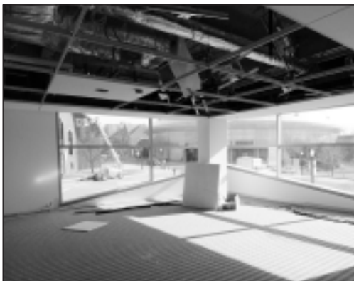
THE STUDENT UNION BOARDROOM, LEFT, AND STUDENT UNION FOOD COURT, RIGHT, UNDER CONSTRUCTION.