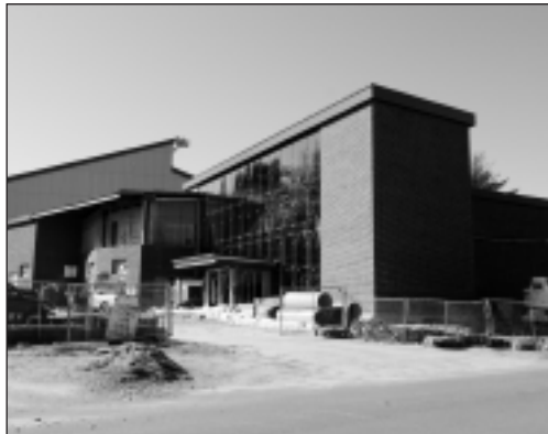
THE INTRAMURAL RECREATIONAL AND INTERCOLLEGIATE FACILITIES PROJECT UNDER CONSTRUCTION.

Financial Services Corporation using a capital lease structure with an average interest rate of 4.5%. Cost-avoidance achieved through the construction of the facility will generate funds to pay the debt and debt service. Construction manager for the building portion of the project is O & G Industries of Torrington, CT, under contract with Select Energy, and the Project Manager is Dahlen, Berg & Co. of Minneapolis, MN.