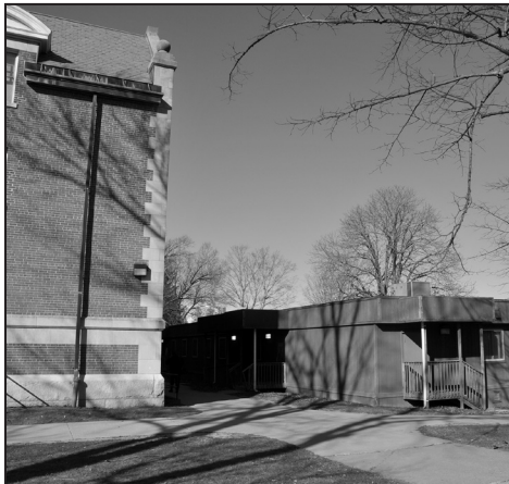
RESIDENTS OF STORRS HALL, PART OF UCONN'S "OLD CAMPUS," HAVE BEEN USING A MODULAR BUILDING PLACED IN FRONT OF THE ORIGINAL STRUCTURE FOR MORE THAN A DECADE. DESIGN WORK HAS NOW BEGUN ON AN ADDITION TO THE BUILDING, WHICH IS EXPECTED TO ALLEVIATE THE SPACE CRUNCH AND ALLOW THE UNIVERSITY TO REMOVE THE MODULAR.

When the Stamford Downtown Campus was constructed, the majority of funds were spent on academic building and site work. Additionally, the academic building requires HVAC system work. As a result of the reallocation of bond funds, planning for this project is on hold.