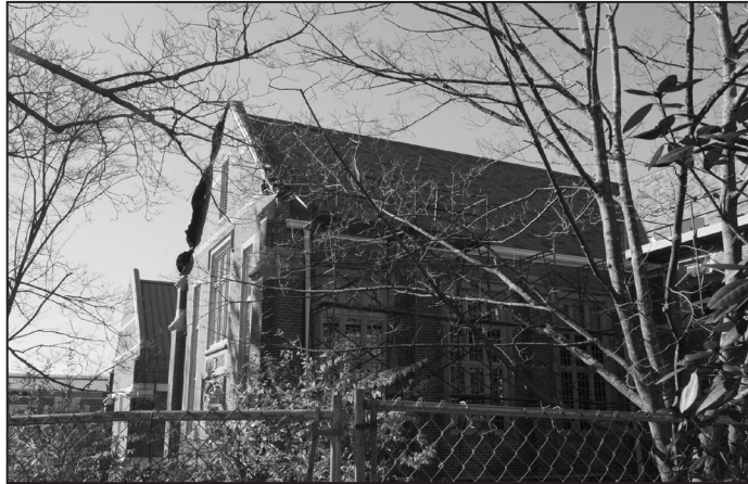
FAÇADE IMPROVEMENTS AND UPDATES FOR THE MECHANICAL SYSTEMS IN THE WILLIAM BENTON MUSEUM OF ART ARE PROGRESSING AND ARE EXPECTED TO BE COMPLETED IN 2010. THE 28,000-SQUARE-FOOT BUILDING, WHICH FIRST OPENED IN 1920, IS AN INTEGRAL PART OF THE SCHOOL OF FINE ARTS.

Beach Hall was constructed in 1929 and contains research labs, offices and classrooms for various schools in the College of Liberal Arts and Sciences. The four-story building has 83,500 square feet of space. A general renovation (including building systems, code/ADA and interior upgrades) of the facility is required to meet its current use. The project design phase is underway; and construction will take place over several years. A variety of code upgrades are in process with an estimated completion by the end of the year.