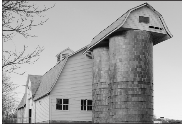
THE HISTORIC YELLOW BARN ADJACENT TO ROUTE 195 IS AMONG A NUMBER OF AGRICULTURAL BUILDINGS ON CAMPUS UNDERGOING REPAIRS AND RENOVATIONS TO ENHANCE THE FARM OPERATIONS.