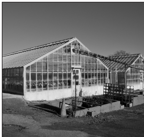
THE FLOWERS THEY CULTIVATE AND SELL ARE THINGS OF BEAUTY, BUT THE FLORICULTURE GREENHOUSE ITSELF LEAVES MUCH TO BE DESIRED. CONSTRUCTED IN 1953, THE STRUCTURE, ON ROUTE 195 JUST BELOW THE TOWERS RESIDENCE HALLS, IS IN NEED OF REPLACEMENT GREENHOUSES AND MECHANICALS, WHILE RENOVATIONS ARE NEEDED IN THE CLASSROOM AND OFFICES LOCATED IN THE BUILDING.

Numerous planning and design efforts since 1991 have evaluated the needs of the School of Fine Arts. In light of the changes in these programs, the Storrs Center initiative, and the dispersal of the School of Fine Arts facilities throughout the Storrs and Depot campuses since 1991, a revised Master Plan has assessed the condition of the current facilities, updated the program requirements of the School, and made draft recommendations to guide the use of UCONN 2000 funds at this location. The final Master Plan document will be submitted this fall.