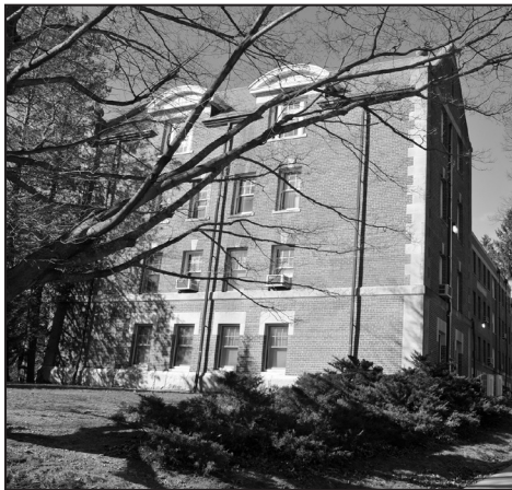
KOONS HALL, ONE OF THE OLDEST BUILDINGS ON CAMPUS (1915), IS IN LINE FOR FAÇADE REPAIR, WINDOW REPLACEMENT, AND MECHANICAL WORK. THE STRUCTURE, HOME TO UCONN'S DEPARTMENT OF ALLIED HEALTH, OFFERS FIVE FLOORS OF LABS, OFFICES AND CLASSROOMS.

The Jorgensen Center for the Performing Arts was constructed in 1956 for orchestra performances. Over the years, it has been modified to accommodate events and gatherings ranging from student functions to theater performances. The building contains five levels, including mezzanine levels above the basement and first floor. With a total of 76,408 square feet of space, the lower floor houses the Little Theatre, the Jorgensen Gallery, and a television studio. The upper floors contain a 2,600-seat auditorium, lobby areas, and support facilities. One of the shortcomings of the building is the lack of a fly loft. This project will evaluate the need for such capacity. Also included in the project are life safety, mechanical and electrical systems improvements, ADA modifications, and perimeter drainage repairs. Construction has begun on the life safety improvements (including a new fire alarm) and will be complete in spring 2010.