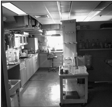
FIFTY-SIX YEARS AFTER ITS CONSTRUCTION, THE W.B. YOUNG BUILDING, WHICH HOUSES LABORATORIES, CLASSROOMS AND OFFICES, IS SLATED FOR A MAJOR RENOVATION. ONE OF THE BUSIEST BUILDINGS ON CAMPUS, THOUSANDS OF STUDENTS ENROLLED IN THE COLLEGE OF AGRICULTURE AND NATURAL RESOURCES MARCH THROUGH THE STRUCTURE ANNUALLY. WORK WILL BEGIN ON THE EXTERIOR OF THE BUILDING AND ITS MECHANICAL SYSTEMS BEFORE MOVING INSIDE. AN ARCHITECTURAL AND DESIGN TEAM IS EXPECTED TO BE SELECTED SOON.

square feet of space). These buildings were constructed in 1964, 1968 and 1971 respectively. Virtually no renovation or expansion has taken place in the intervening decades. In order for the buildings to meet their functional needs for the twenty-first century renovations/improvements are needed on all buildings. The renovations are being phased over several years. Roof replacement of the Library and Undergraduate Buildings has started construction; a preliminary study of the HVAC systems and sidewalk/parking/ADA upgrades is under review. The School of Social Work façade and roof repair project is out for bidding with an anticipated construction start in late fall 2009. Other design projects include ADA upgrades at various buildings, campus wide electrical upgrades, and road replacement and repair.