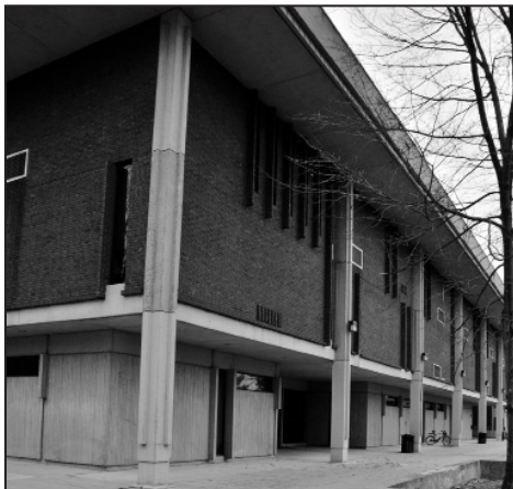
THREE BUILDINGS AT UCONN'S WEST HARTFORD CAMPUS, WHICH SERVE THOUSANDS OF STUDENTS ANNUALLY, ARE SCHEDULED FOR THEIR FIRST EXTENSIVE RENOVATION SINCE THEIR CONSTRUCTION IN THE LATE 1960S AND EARLY 1970S. THE BUILDINGS — A CLASSROOM BUILDING, A LIBRARY AND THE SCHOOL OF SOCIAL WORK — REQUIRE 21ST CENTURY UPGRADES AND FUNCTIONAL RENOVATIONS, INCLUDING NEW ROOFS. WORK IS SCHEDULED TO BE PHASED IN OVER SEVERAL YEARS.

As enrollment increases at the Waterbury campus, changes will be needed to meet new enrollment levels and program needs. The project would permit these modifications, as well as more immediate needs. The courtyard is presently being enhanced, and the roof/AC enclosure requires minor improvement. As a result of the reallocation of bond funds, further planning for this project is currently on hold.