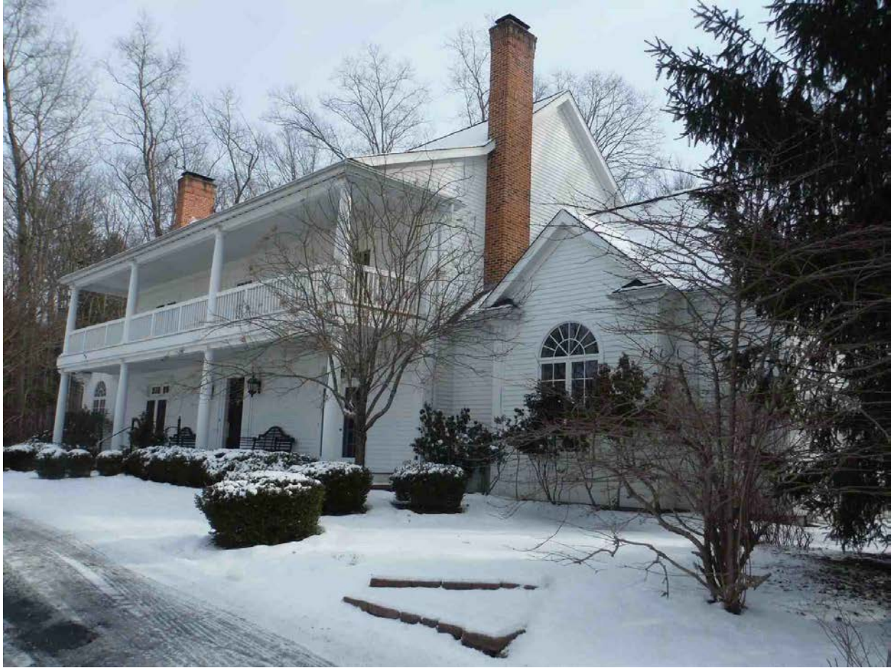
88 Gurleyville Road, Mansfield CT