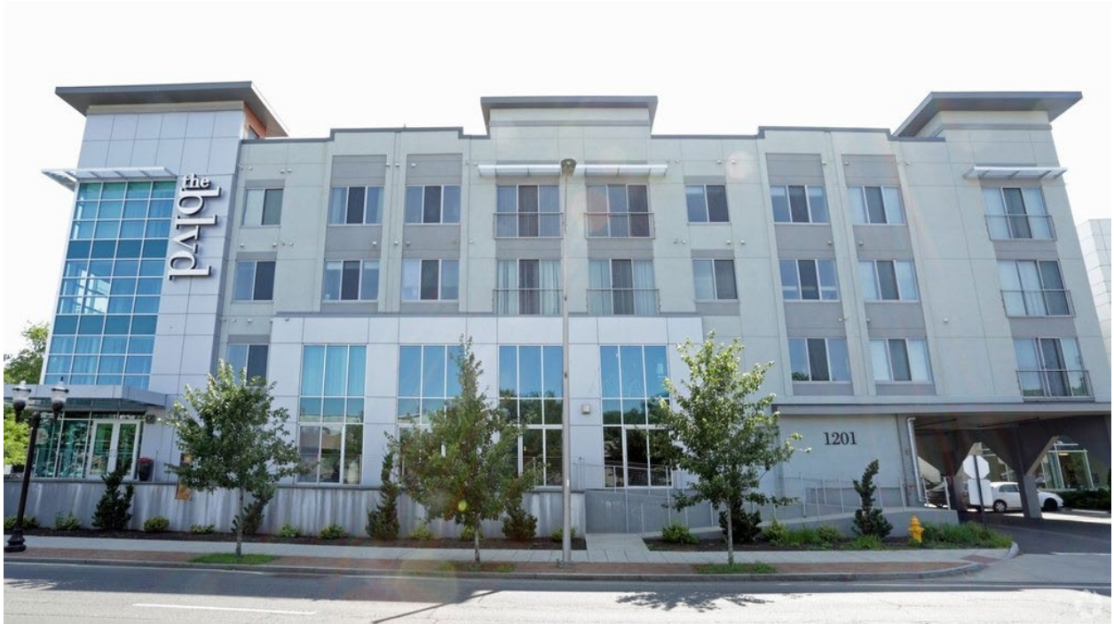
Existing Apartment Building at 1201 Washington Boulevard, Stamford CT